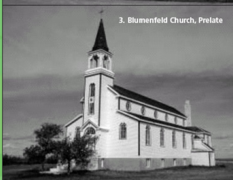
3. Blumenfeld Church, Prellate