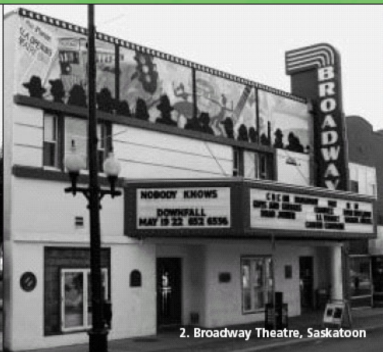
2. Broadway Theatre, Saskatoon