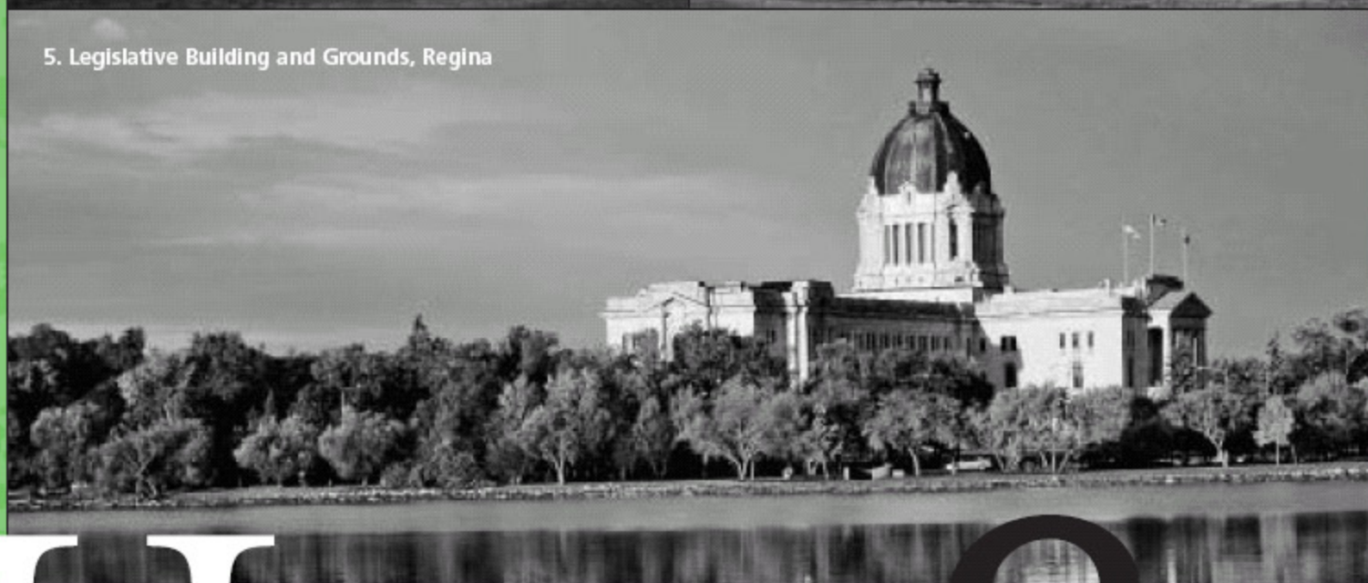
5. Legislative Building and Grounds, Regina