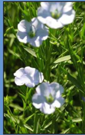
Dark Brown Soil Zone