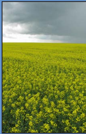
Black Soil Zone