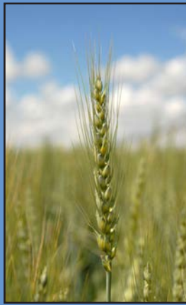
Brown Soil Zone