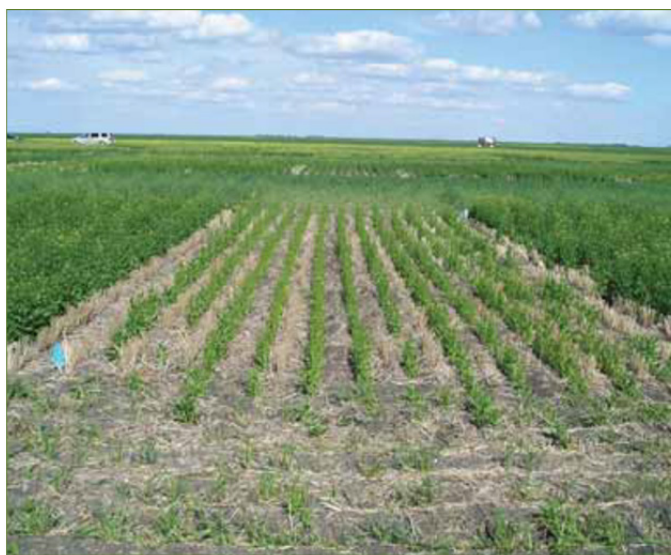
Research plots with 0 N/ha in the middle, 125 N/ha on the left and 75 N/ha on the right.

The soil nutrient requirements of camelina are similar to those of other Brassica crops with the same yield potential. Camelina has been shown to respond to nitrogen (N) similarly to mustard or flax. However, it can yield well with lower nutrient inputs. In the Maritimes, Urbaniak et al. (2008) observed no yield increases beyond 60 kg N/ha in Nova Scotia. While at a site in Prince Edward Island yield increases were observed up to 120 kg N/ha, seed yield increases beyond 80 kg N/ha were not significant. At four locations on the Prairies (Scott, Melfort, Lethbrige and Swift Current) AAFC scientists observed increasing yields up to the 120 kg N/ha rate with no significant increase beyond that. In Oregon (USA), no increases in yield were observed beyond 50 kg N/ha (Ehrensing and Guy, 2008). Research clearly demonstrates that the fertilizer requirement and response in camelina varies with soil and growing conditions. Other nutrient requirements for camelina are similar to those of other Brassica species. However, more studies on other nutrient requirements on the prairies are needed.