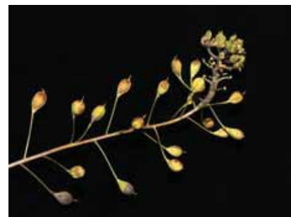
White rust 'staghead' on camelina.