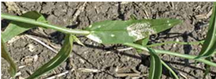
White rust symptoms on camelina leaf.

White rust is caused by Albugo candida . It is a major disease of crucifer crops worldwide. Symptoms on camelina include powdery white pustules containing sporangia on lower leaf surfaces and hypertrophied siliques or entire inflorescences (staghead) that are conspicuous later in the growing season. Stagheads are green at first, but become brown and brittle at maturity. They contain thick-walled oospores that may survive in soil for several years before germinating to produce motile zoospores that infect cotyledons and rosette leaves. Research results have shown that the isolate of A. candida from C. sativa was different from races two and seven, which are prevalent on Brassica crops in Western Canada. So far, no resistance to white rust has been observed in camelina germplasm.