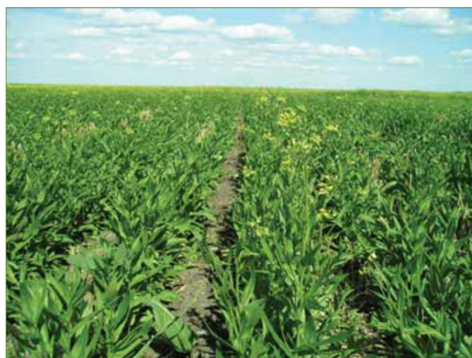
Camelina crop at the vegetative/pre-bolting stage.

Studies in Saskatchewan (Gugel and Falk, 2006) showed that camelina yields are comparable to those of other Brassica species ( B. rapa , B. juncea , and B. napus ). Camelina yields tend to be lower than the other species under adequate precipitation conditions. However, camelina out-yielded other Brassica species when moisture was limiting or untimely. Seed yield of the accessions tested ranged from 1,638 to 3106 kg/ha over two locations in the Saskatoon area. In Alberta, camelina seed yield ranged from 1,987 to 3,320 kg/ha over two locations near Beaverlodge. In the Maritimes, Urbaniak et al. (2008) observed seed yield ranging from 1,096 to 1,660 kg/ha over two locations and two seasons. Research also confirmed that camelina performs very poorly under water-logged conditions. Severe early season water logging led to a 27 to 32 per cent loss of plant stand at harvest (Gesch and Archer, 2009). Camelina needs well aerated soils to obtain profitable yields.