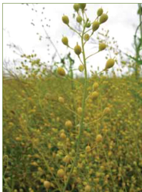
Mature camelina pods.

Camelina is an early maturing crop (85 to 100 days). Camelina can be direct combined or swathed and combined. It has been found to be more resistant to shattering than canola. Swathing has been found to be a suitable option and the crop holds well in the windrow. However, straight cutting is recommended due to potential damage from wind and because shattering losses are minimal. If swathing is necessary, swathing should be done when 75 per cent of the crop has turned