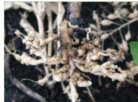
Clubroot symptoms on camelina roots.

Camelina was found to be highly susceptible to clubroot. Research trials in Alberta have revealed that the symptoms on camelina were typical to those observed on canola. To date, no resistance was found in camelina for clubroot disease. Therefore, this crop will not provide a viable rotation alternative in areas where clubroot is prevalent.