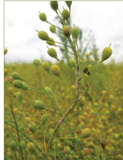
Downy mildew on camelina.

Downy mildew is a common disease of crucifer crops and is often associated with white rust. Downy mildew infection can be localized or systemic. Downy mildew on Camelina sativa is caused by Perenospora parasitica . This disease was most commonly noticed in Saskatchewan camelina fields. Symptoms on camelina include grayish-white mycelial growth on lower-leaf surfaces, stems and pods. Severely infected plants may be malformed. Researchers have found some resistance to this disease that would allow the development of downy mildew resistant cultivars in the future.