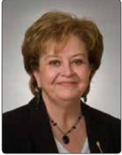
The Honourable Donna Harpauer Minister of Finance

I am pleased to present the Ministry of Finance Plan for 2018-19.