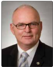
The Honourable Lyle Stewart Minister of Agriculture

I am pleased to present the Ministry of Agriculture's Operational Plan for 2018-19.